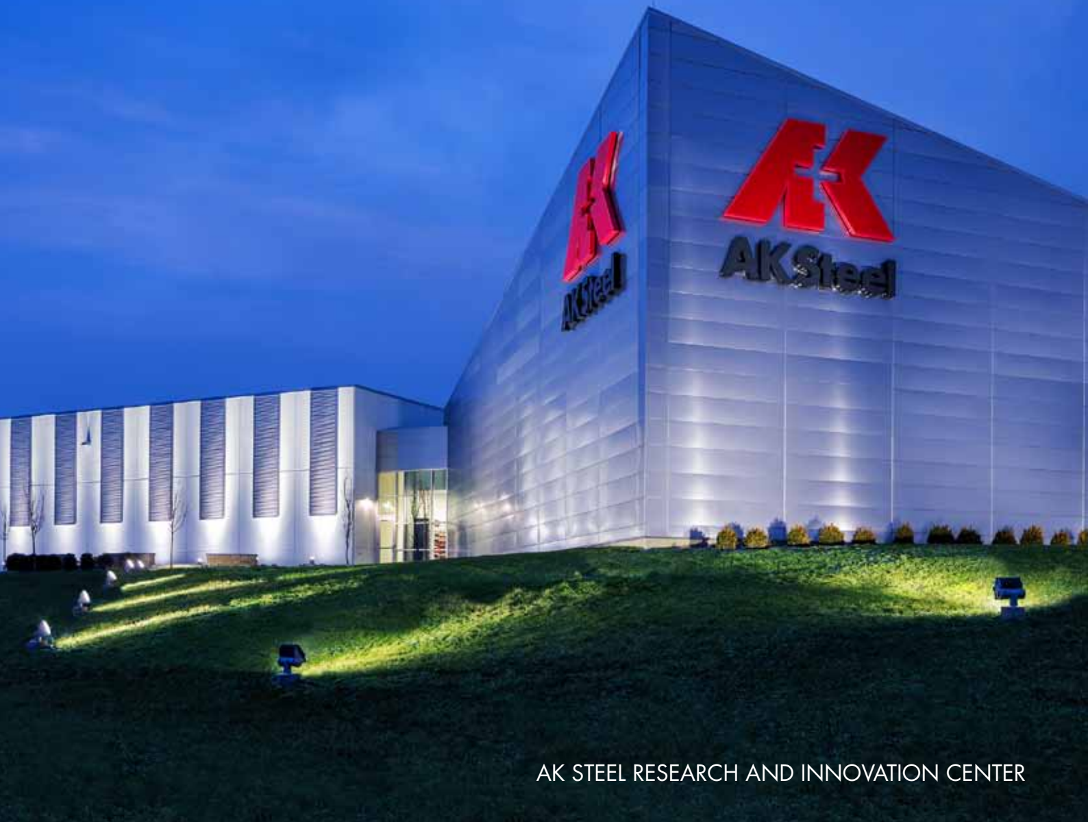
AK STEEL RESEARCH AND INNOVATION CENTER